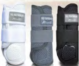
PRO PERFORMANCE ELITE XC BOOTS