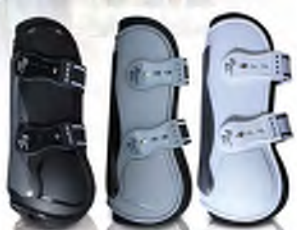
PRO PERFORMANCE SHOW JUMP BOOTS